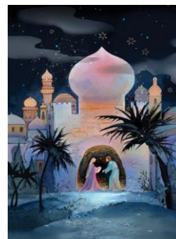
'Bethlehem Evening' Inside message: 'Wishing you a Merry Christmas'