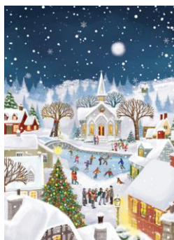
'Winter Village' Inside message: 'Season's Greetings'