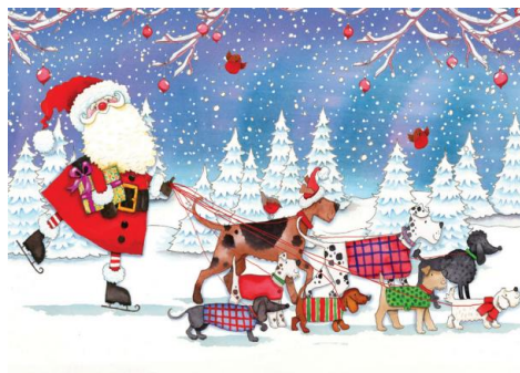
'Santa's Helpers' Inside message: 'Wishing you a Merry Christmas and a Happy New Year'