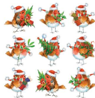
'Festive Robins' Inside message: 'Season's Greetings'