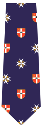
St John Eye Hospital Silk Tie £25

All Christmas cards are £5 for packs of 10! See below for our newest cards!