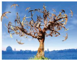
Swift Tree Cards (pack of 5, blank inside) £5