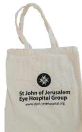
Cream Tote Bag £3.50