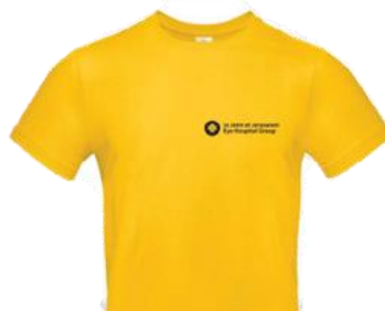
Unisex SJEH Tshirt (Gold) S/M/L available £15