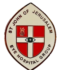
Lapel Pin Badge £5