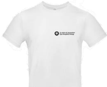
Unisex SJEH Tshirt (White) S/M/L available £15