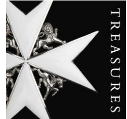
'Treasures' by Tom Foakes £50