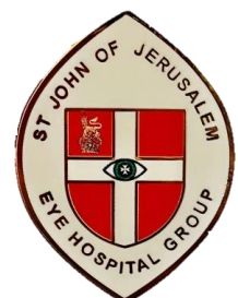
Lapel Pin Badge £5