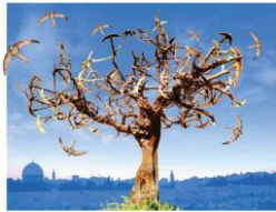
Swift Tree Cards (pack of 5, blank inside) £5