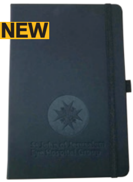
A5 Notepad - £10