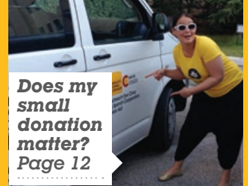
Does my small donation matter? Page 12