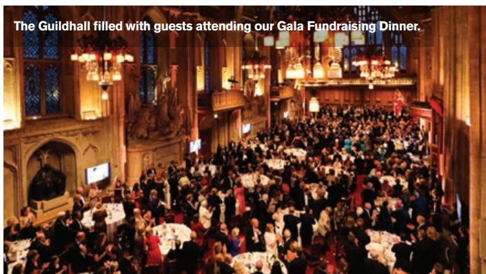
The Guildhall filled with guests attending our Gala Fundraising Dinner.

economic and political possibility... Far more than airstrikes and boots on the ground, empowered women combat poverty, desperation, and radicalisation.”