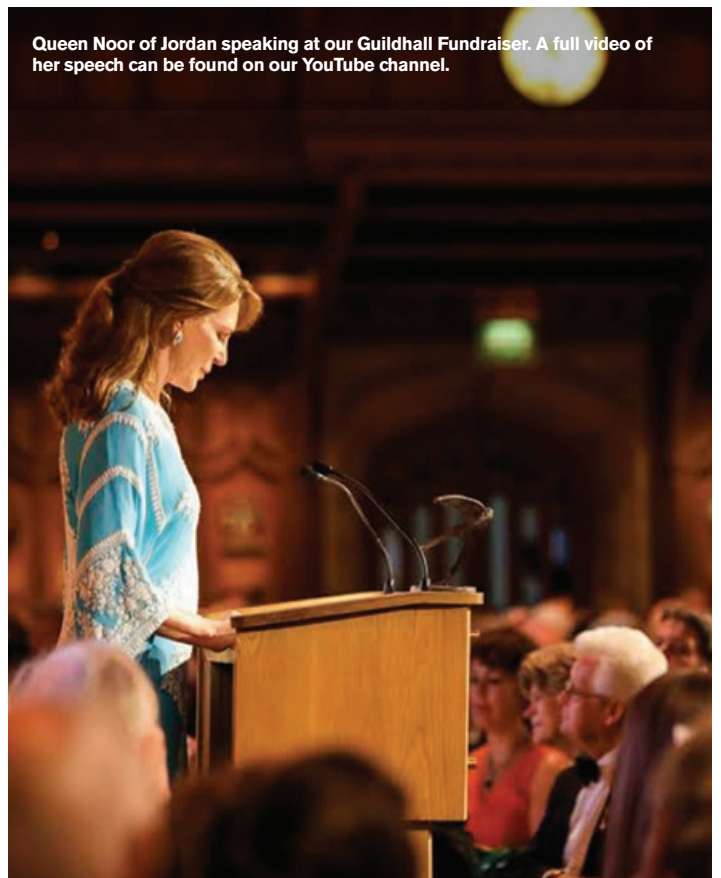
Queen Noor of Jordan speaking at our Guildhall Fundraiser. A full video of her speech can be found on our YouTube channel.

“Over the decades we have clearly seen ripples of hope and progress set in motion by empowered women raising daughters and sons with access to horizons of gender, social,