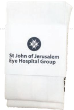
100% Cotton Tea Towel - £5.00