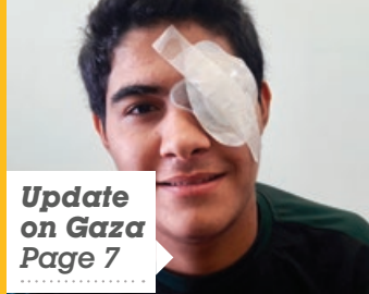
Update on Gaza Page 7