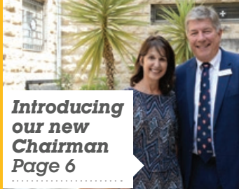
Introducing our new Chairman Page 6