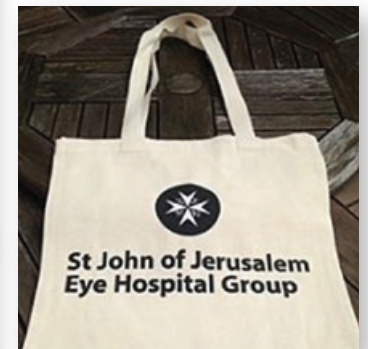
Tote Bag - £3.50