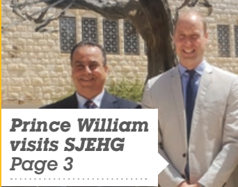
Prince William visits SJEHG Page 3

The Newsletter of St John of Jerusalem Eye Hospital Group - The only charitable provider of expert eye care in the West Bank, Gaza and East Jerusalem; treating patients regardless of religion, ethnicity, or ability to pay