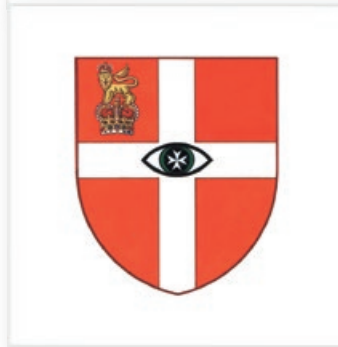
St John Blank cards: SJEHG Coat of Arms or St John Logo - £5.00 (107mm x 107mm)