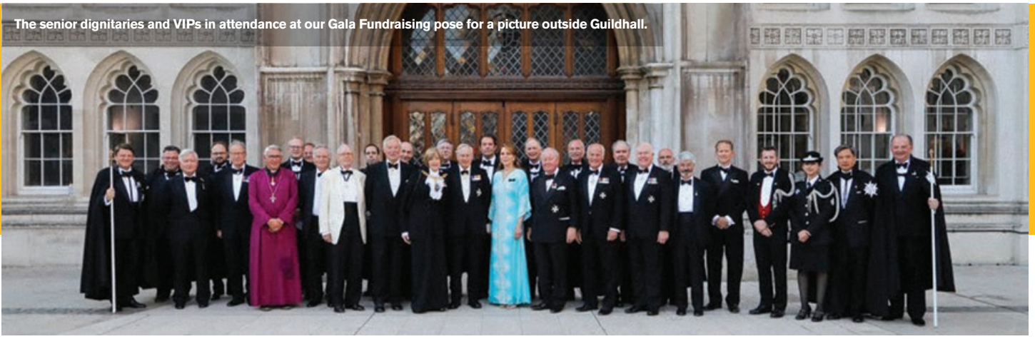
The senior dignitaries and VIPs in attendance at our Gala Fundraising pose for a picture outside Guildhall.